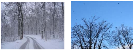
Paige Barbour Davis, Old Greenwich photographer